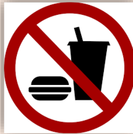
(people – fast)