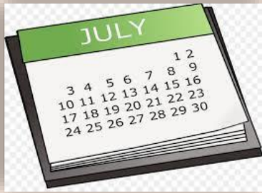
(Ramadan – month)

Write a short paragraph of three sentences using guide pictures and words about (Ramadan):