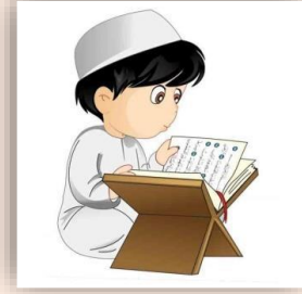
(read – Quran)